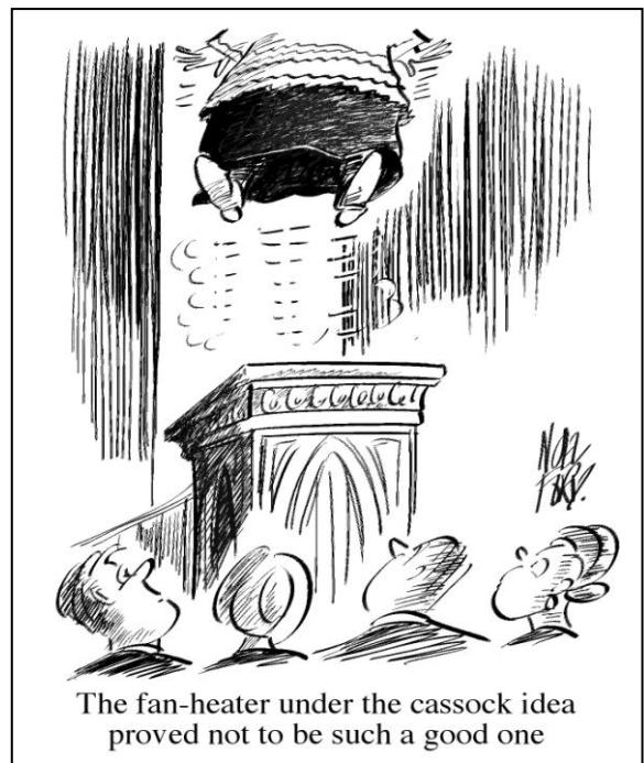
The fan-heater under the cassock idea proved not to be such a good one

Perhaps it's time to re-read that favourite poem again!