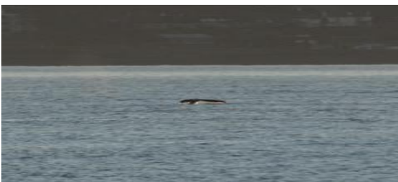
Humpback whale in the Firth of Forth

I trust the joy of Christmas continues to be a source of comfort, strength, and inspiration during this season of Christmastide. As one who loves the community aspect of the festive season, it has been quite challenging not to have been together in-person as a congregation. In pre-Covid times, I would have had a couple of open house gatherings at the manse and the church to personally meet you and members/friends of Broughton St. Mary's during these past five weeks. I so look forward to meeting and getting to know each one of you once we get through these difficult days. Meanwhile, here are my top ten favourite things as a brief introduction.